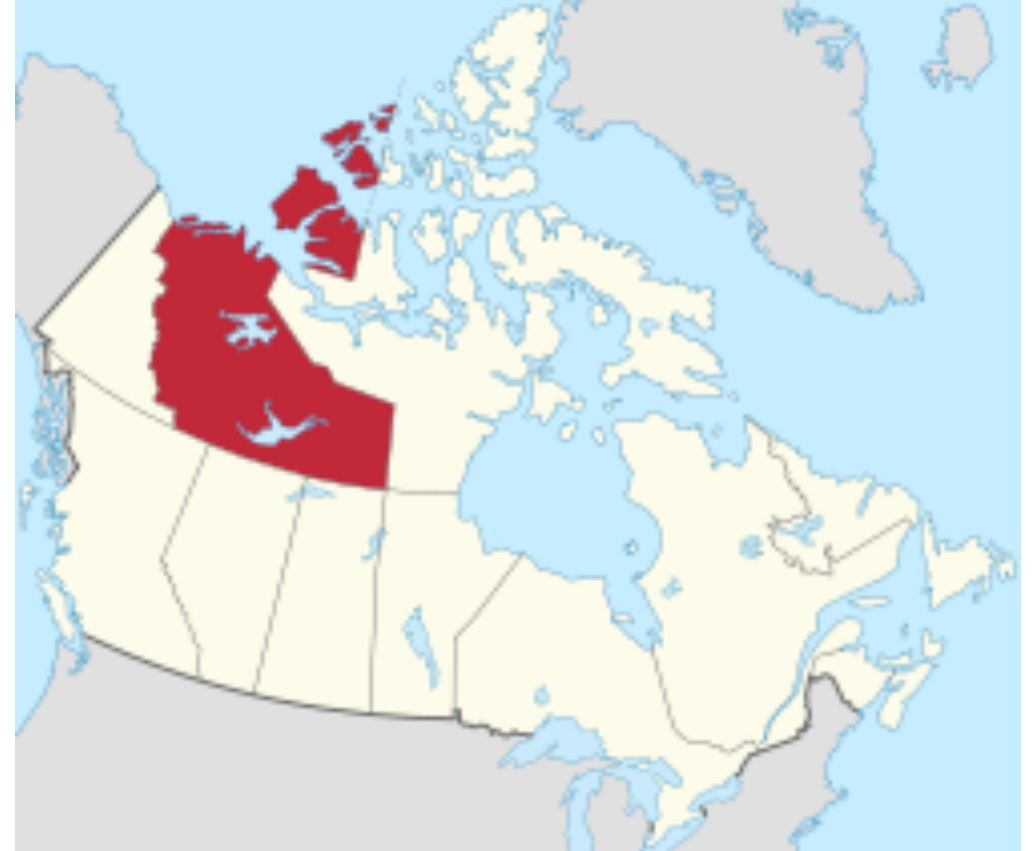
Map of the Northwest Territories, Canada