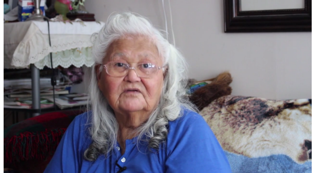
Screen shot from community documentary