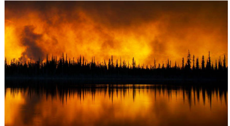
Fires and smoke outside of Yellowknife (summer 2014)