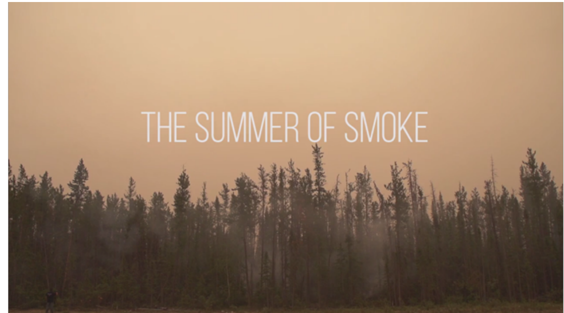
Title screen from community documentary