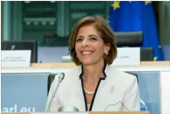
Health Commissioner-designate, Stella Kyriakides

Some Member States are already drafting action plans on this [endocrine disruptors]. We need to support them and I believe that we are all aware that endocrine disruptors are going to be a very important part of the agenda of the next Commission.