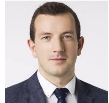
Environment Commissioner-designate, Virginijus Sinkevičius

It is important that endocrine disruptors would be prohibited from toys, cosmetics which we apply directly on our skins, food contact materials.